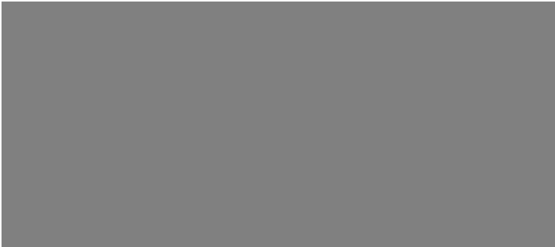
Figure 8. Personal Income by Source for Wallowa County, Oregon and U.S. in 2001.