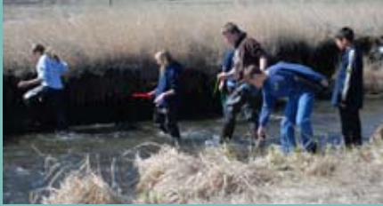
Sixth grade students monitor stream substrate