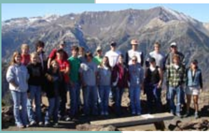
Students atop Mt. Howard